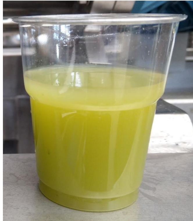
GRANNY SMITH APPLE