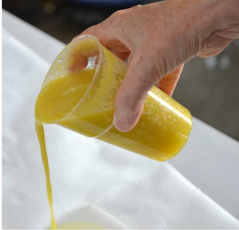
HIGH QUALITY PINEAPPLE PUREE