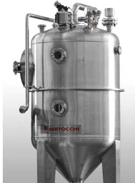
DEA C COLD DEAERATOR