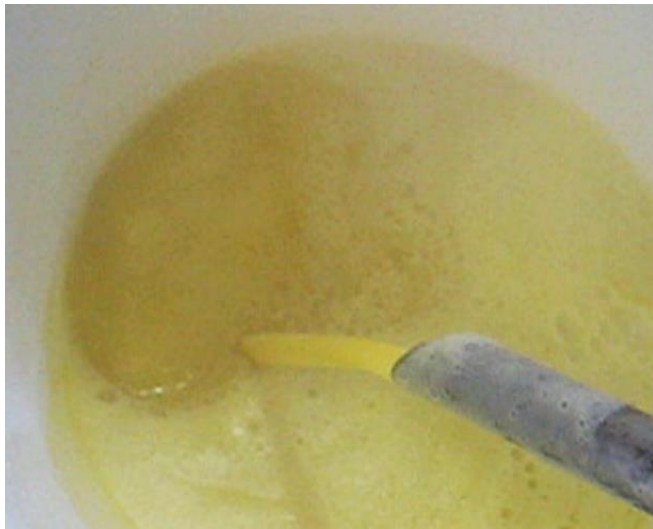
EXTRACTED PINEAPPLE PUREE