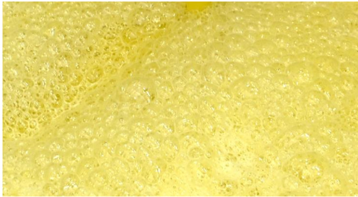
EXTRACTED PINEAPPLE PUREE