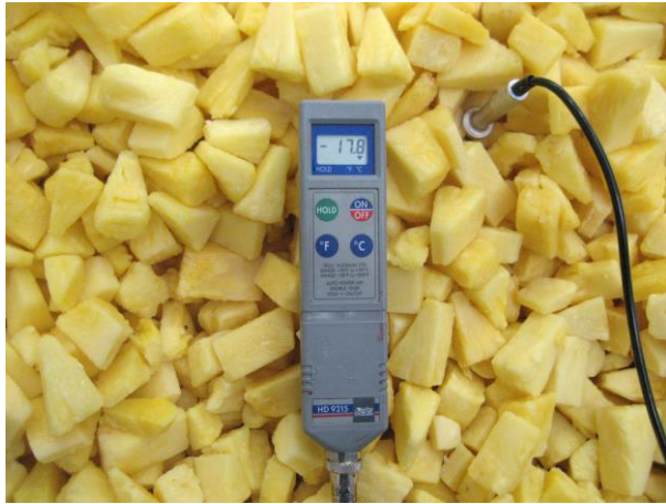
FROZEN PINEAPPLES IQF